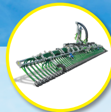
Pendislide PRO 150/60PS2 15-m spreading boom