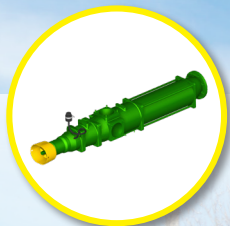
Spiral pump: 4,500 l/min